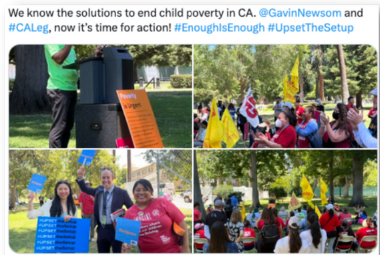
A Twitter post after a rally prior to the first hearing of the state Assembly's Select Committee on Poverty and Economic Inclusion in Sacramento.