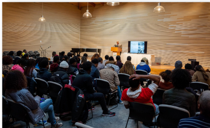
CDF's Black Student Leadership Network gathered at CDF Haley Farm in Clinton, TN, in December, with more than 60 students from colleges and universities across the country.