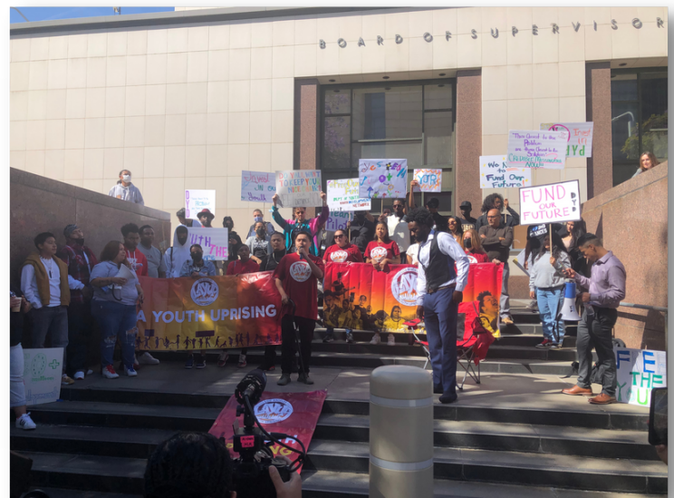
Advocating with partners at the LA County Board of Supervisors for funding to support Youth Justice Reimagined.